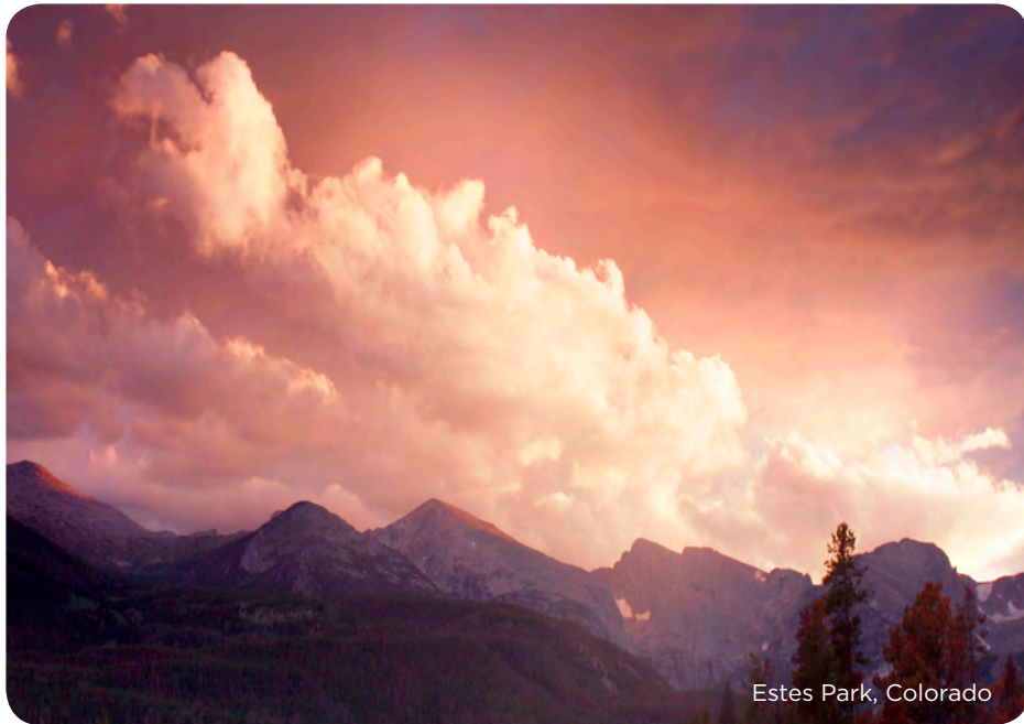
Estes Park, Colorado